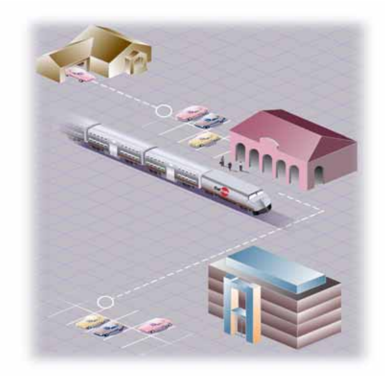
Figure 2: The CarLink Model (Consisting of Three User Groups: Homebased Users, Workbased Commuters, and Workbased Day Users)

Each morning, Homebased Users would drive their CarLink vehicles to a selected transit station, park the car in a designated CarLink space, and ride transit to work. Next, a Workbased Commuter would arrive at the same station via train in the morning; pick up a CarLink car; and drive it to work, parking in a designated CarLink space at their work location. Throughout the day, Workbased Day Users could reserve CarLink vehicles for business and personal errands, returning the cars to a designated work lot after each trip. At the end of the workday, Workbased Commuters drove the CarLink vehicles back to the transit station and would take the train for the remainder of their trip home. After returning Homebased Users—riding the train for the majority of their commute home—arrived at the transit station, they would pick up a CarLink vehicle and drive it home for personal use on evenings and weekends. See Figure 2, below, for a graphic representation of the CarLink model.